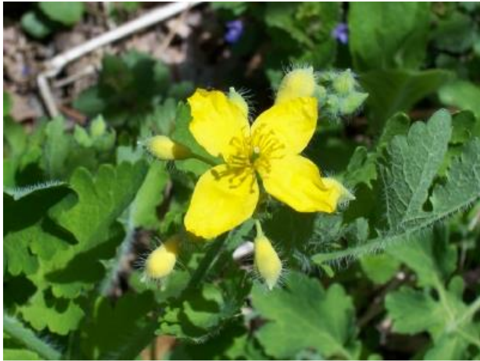
Celandine ( Chelidonium majus )

Plant has pinnate leaves comprised of irregularly lobed and alternate leaflets; stalk is hairy; yellow sap.