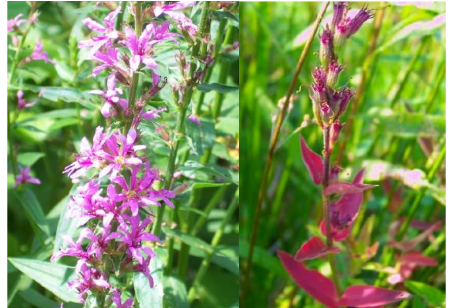
Purple Loosestrife ( Lythrum salicaria )

Square-stemmed plant with opposite paired leaves or whorls of 3 leaves; purple 6-part flowers in a dense spike; often grows in large colonies.