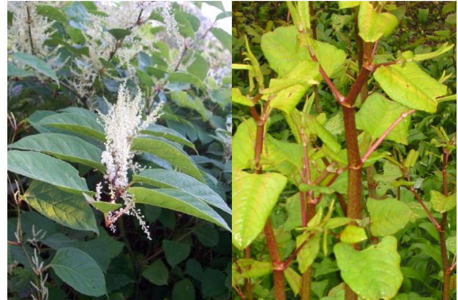
Japanese Knotweed ( Reynoutria japonica var. japonica )

https://www.thebotanist.com/sites/default/files/styles/serve_detail/public/knotweed.JPG?itok=MeTIM6lB