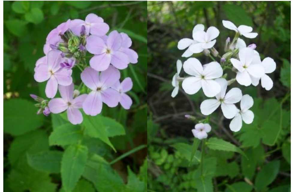
Plant with lanceolate alternate leaves; fragrant 4-part flower (white or pink).