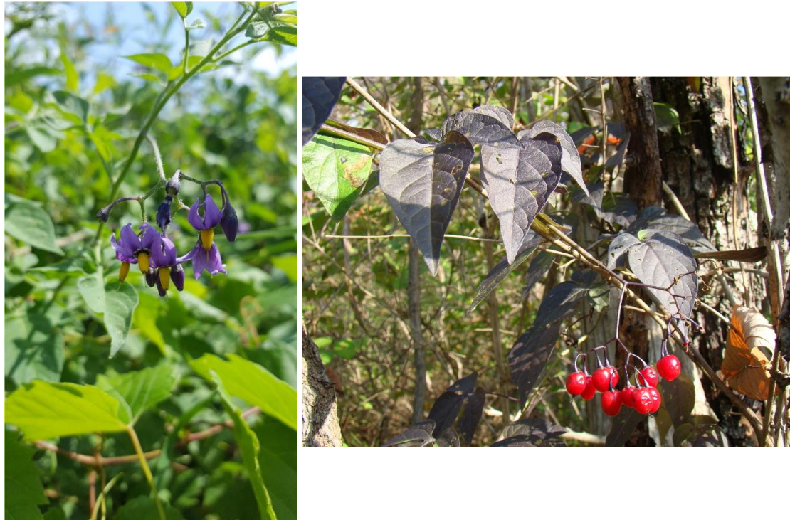
Bittersweet Nightshade ( Solanum dulcamara )

Vine with leaves divided into 3 leaflets with large terminal segment; purple shooting star-shaped flowers; red somewhat poisonous berry-like fruit.