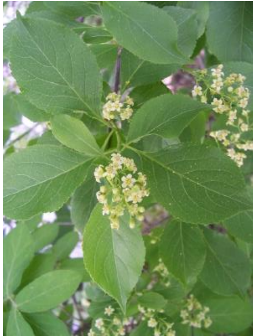
Asiatic Bittersweet ( Celastrus orbiculatus )