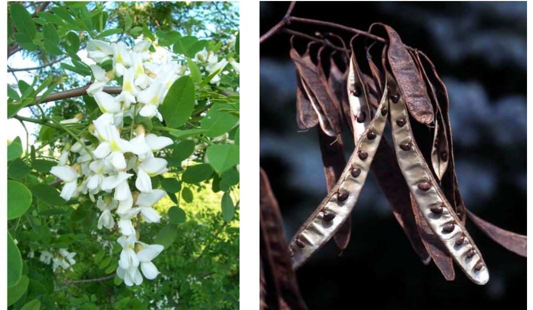
Black Locust ( Robinia pseudoacacia )

http://www.oardc.ohio-state.edu/weedguide/display_photo.php?id=65&photo=422