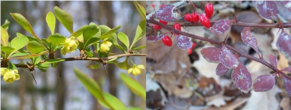
Japanese Barberry ( Berberis thunbergii )

Shrub with non-toothed elliptical leaves and brown twigs; red fruits often persist through winter.