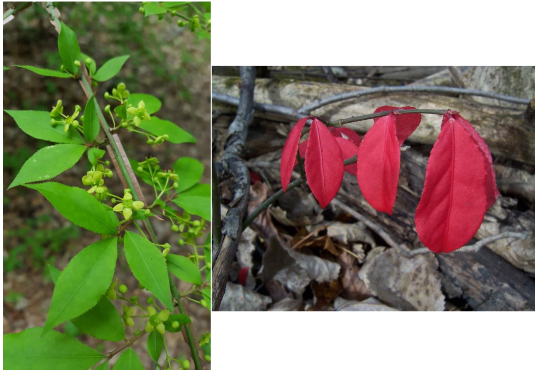
Shrub whose stems are notable for their four corky ridges or "wings." Leaves exhibit bright red fall color.