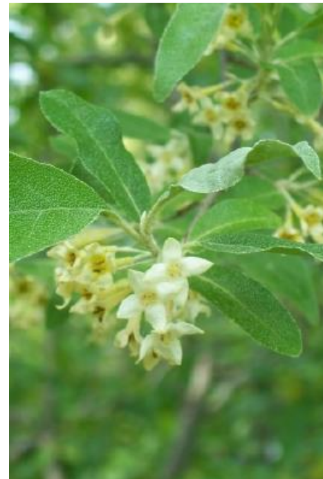
Autumn-olive ( Elaeagnus umbellata )

Woody vine with nearly round, bluntly-toothed leaves; flowers in axillary clusters.