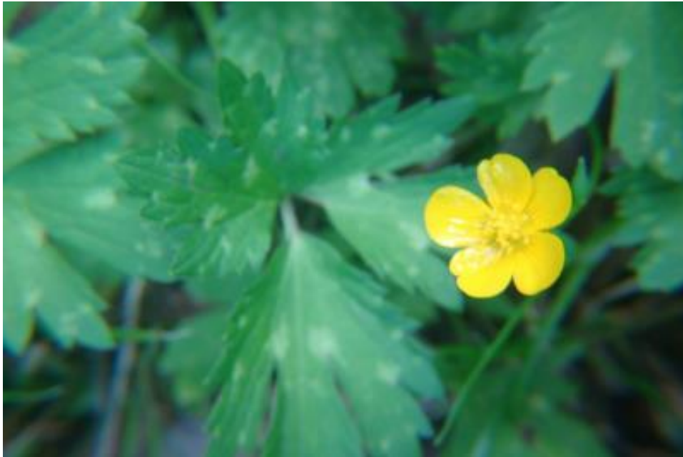
Plant creeping at its base, often forming patches; dark green leaves usually mottled.