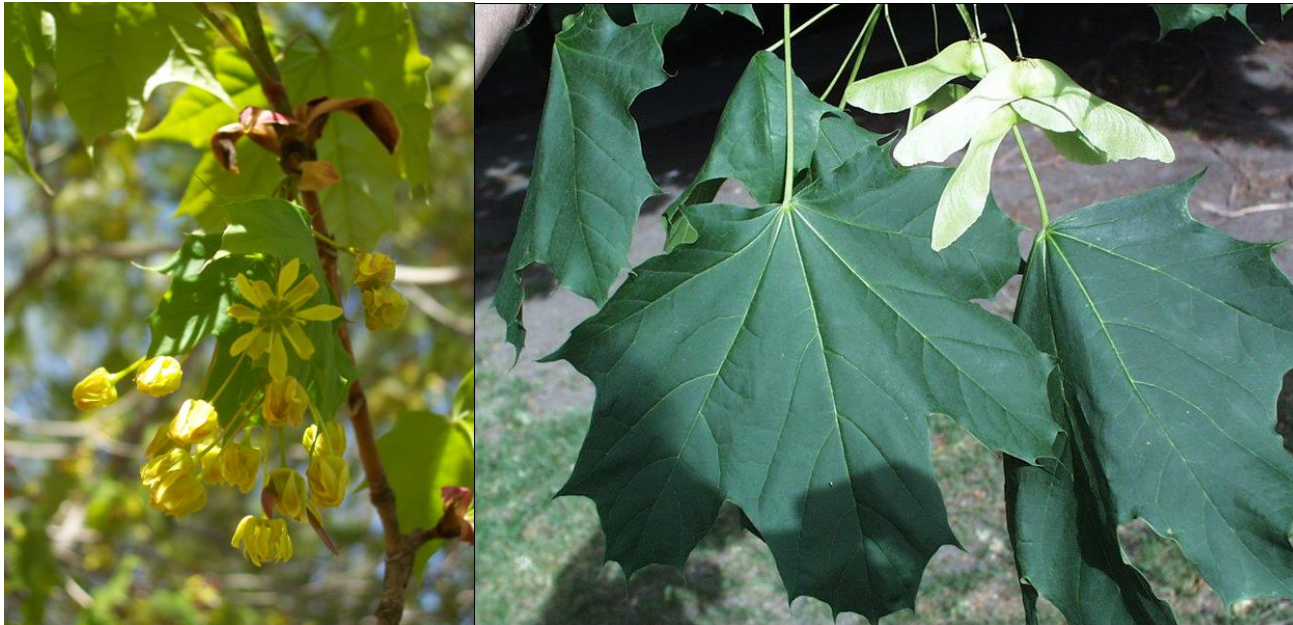
Norway Maple ( Acer platanoides )