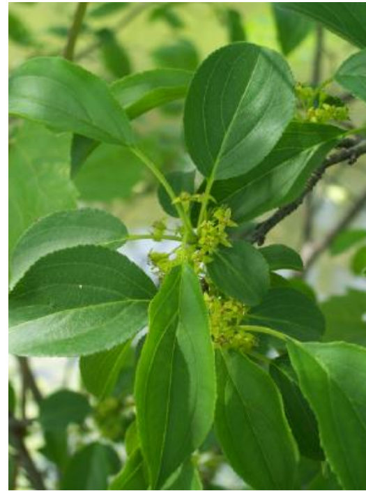
Common Buckthorn ( Rhamnus cathartica )

Shrub with twigs ending in sharp spine; fine-toothed leaves elliptic and hairless; berry-like fruits are black.